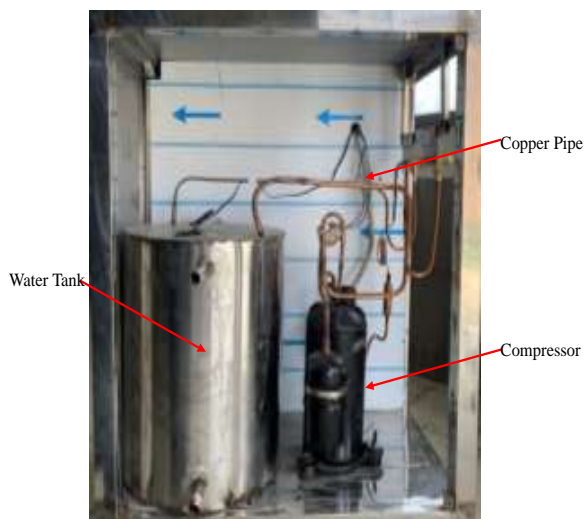
Figure 1(a): Compressor, water tank and copper pipe for heat pump system.

On the basis of the heating and cooling load calculations one-ton geothermal heat pump system is recommended to develop and fabricate one ton capacity geothermal heat pump system. The different components of geothermal heat pump are given in figure 1(a) and (b) respectively.